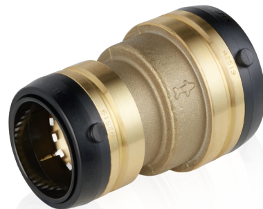
SharkBite 35mm - 54mm