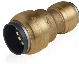
SharkBite 10mm - 28mm

Rigorous manufacturing and quality control, as well as long-term internal product testing, ensure the durability and seamless performance of the SharkBite Air & Pneumatics fittings.