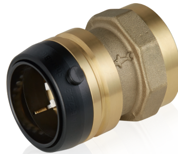
SharkBite 35mm - 54mm