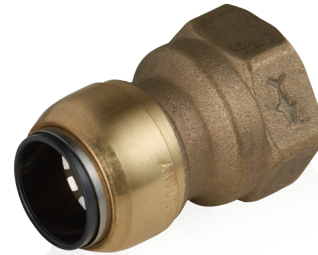
SharkBite 10mm - 28mm

Rigorous manufacturing and quality control, as well as long-term internal product testing, ensure the durability and seamless performance of the SharkBite Air & Pneumatics fittings.