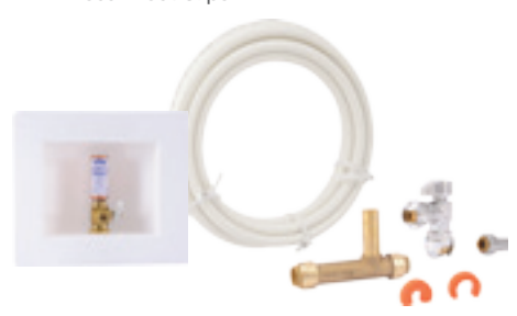
*Click Seal® is a registered trademark of Fluidmaster, Inc.

Installation Kit includes Service Slip Tee, Angle Stop, Valve Connector, PEX, and Disconnect Clips