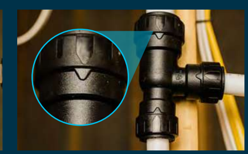
Step 3: Lock

Turn the locking cap quarter turn clockwise to the locked position, an audible click will be heard.